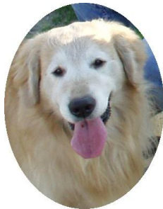
Ceile's Mardovar Caleb