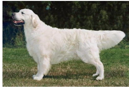
Ch.Paudell Easter Plantagenet at Kerrien