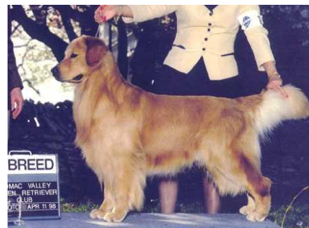
Ch.Twin-Beau-D's Peterbuilt SDHF OS