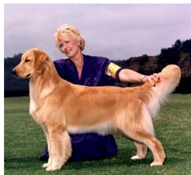
Ch.Birnam Wood's Toad You So OD