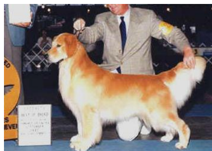
Ch.Lovejoy's Catch Me If U CanCan SDHF OS