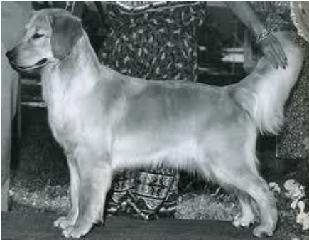
Ch.Wingate's Fast Getaway