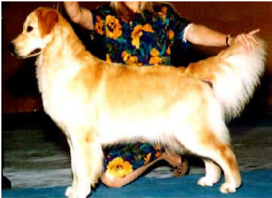
Ch.Wayward's Walk This Way