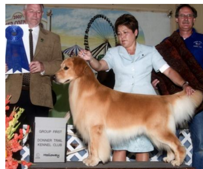
Ch.Birnam Wood's Hoot Gibson SDHF OS