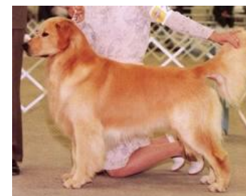
Ch.Claircrest Nobody's Business OS