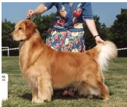
Ch.Calypso Udderwise Aldnon