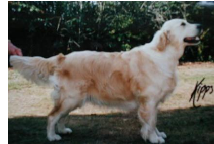
Ch.Telkaro Royal Romance of Colbar