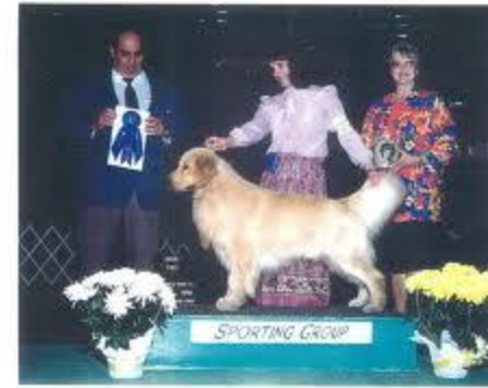
Ch.Carlin's Holiday A Xmas Carol OS