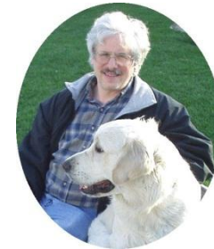
Colbar Royal Coachman