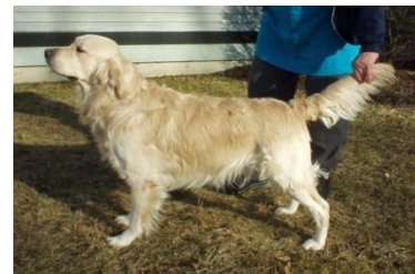
Colbar Royal Coachman