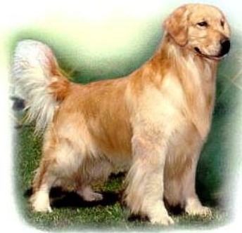
Ch.Asterling's Buster Keaton OS