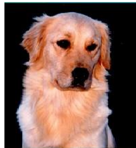
Mardovar's Fireside Ceile Noel