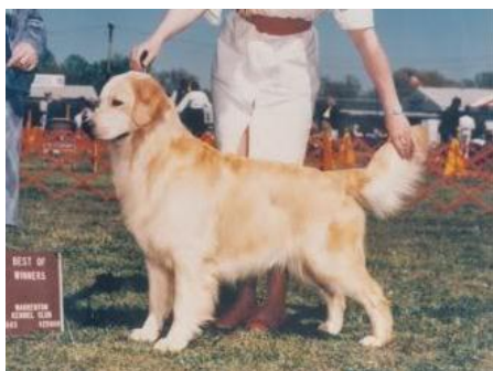
Ch.Mardovar's Go Furr Broke OS