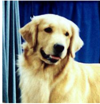
Ch.Goodtimes Raining Comets OD