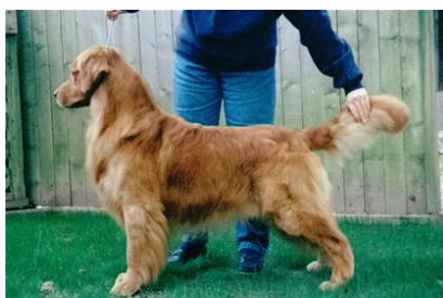
Ch.Pebwin Making the Odds OS