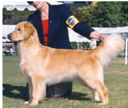
Ch.Birnam Wood's Take Center Stage