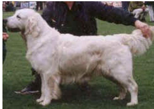
Irish Sh.Ch. Erinderry Amber of Tyrol