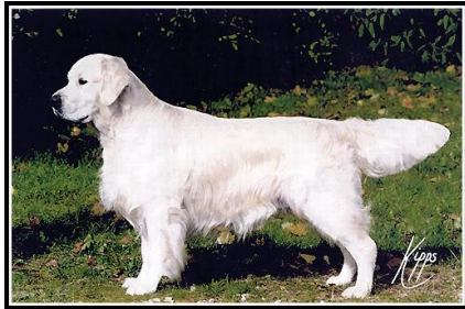
Ch.Erinderry Diamond Edge of Glenavis