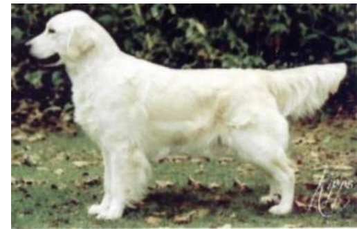
Eng.Sh.Ch.Colbar Royal Rhapsody JW